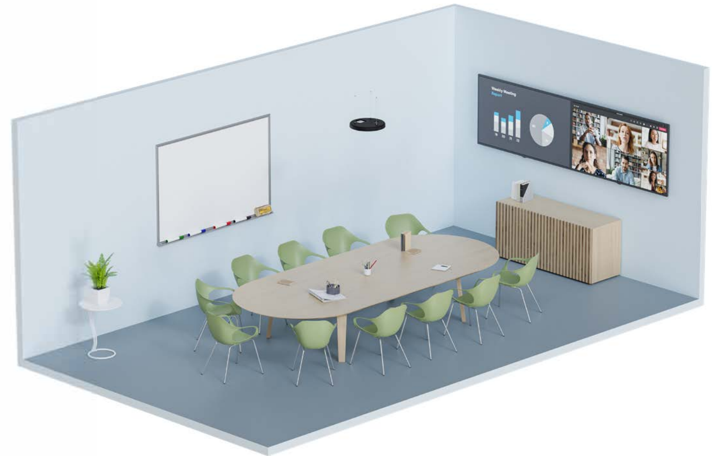
Mid-sized meeting room equipped with TeamConnect Ceiling Medium.