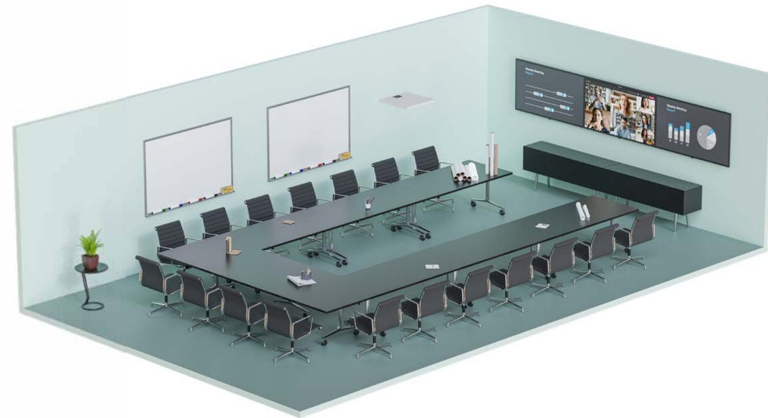
Large meeting room equipped with TeamConnect Ceiling 2.