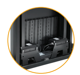
CABLE MANAGEMENT & STRAIN RELIEF