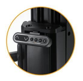
INTEGRATED CONTROL PAD