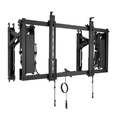
LVSXU 42 - 80″ Landscape Mount without Rails